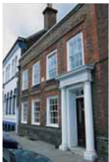
18 Court Street (Shepherd Neame brewery)

For further information contact: Faversham Tourist Information Centre Fleur de Lis Heritage Centre 10-13 Preston Street, Faversham Tel: (01795) 534542 Email: faversham@btinternet.com