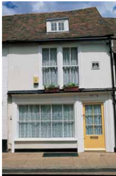
74 West Street

Three out of four of Faversham's cinema buildings survive – probably a record for a small town of about 18,000 people. One remains in daily use – the Royal , with the only surviving big screen in Kent. Opened as an Odeon in 1936, it was designed by Andrew Mather, prince of cinema architects. Planned to harmonise with nearby 16th century buildings it is one of only two 'Tudorbethan' cinemas left in Britain. Legacies of the first generation of cinemas are the florid-fronted Gem , now a shop, and the Empire in Tanners Street, built as a school in 1861, converted into a cinema in 1910, and then into the town's Roman Catholic Church in 1937. The Argosy (later called the Regal ), now completely gone, stood at 72 Preston Street.