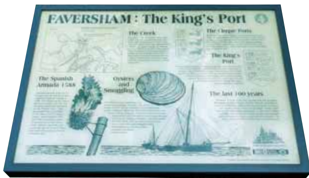
Information Panel at the Creek