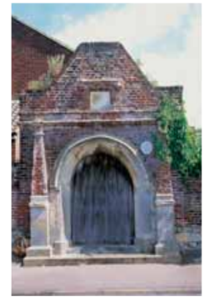
The Old Gate