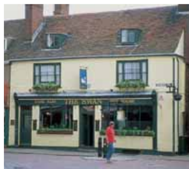
The Swan Inn

Erected in the 1920s, replacing an earlier building of about 1840.