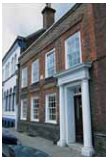
18 Court Street (Shepherd Neame brewery)

For further information contact: Faversham Tourist Information Centre Fleur de Lis Heritage Centre 10-13 Preston Street, Faversham Tel: (01795) 534542 Email: faversham@btinternet.com